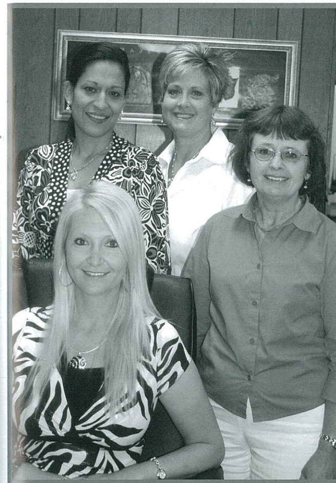
ADMINISTRATION OFFICE STAFF